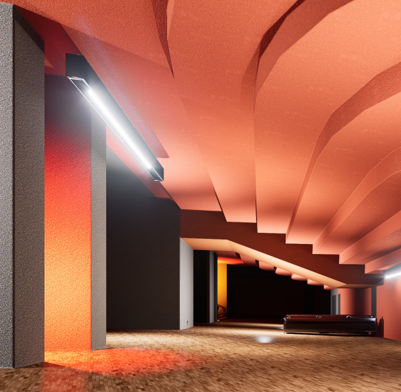
LOD3 model of the cavernous Arts & Conference Centre main foyer

“The Barbican Renewal Project posed a unique challenge: delivering accurate BIM models and survey data across a vast, complex site with sensitive performance spaces. The scale and intricacy of the task led some to believe it was impossible for a single company to tackle alone. However, Plowman Craven overcame it by blending advanced technologies, leveraging market-leading BIM expertise, and deploying skilled surveyors and modellers.