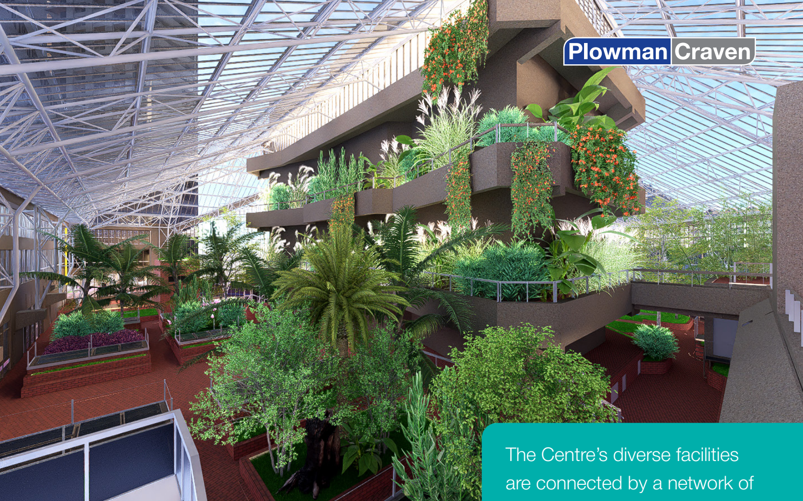
LOD3 model of the unique Barbican Conservatory